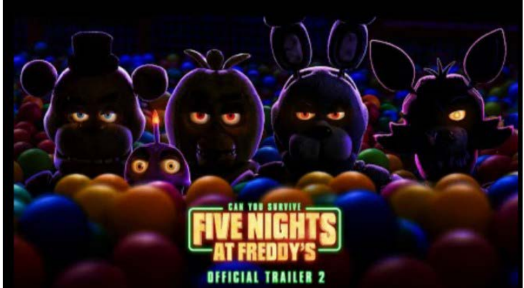
FNaF Trailer 2 Thumbnail