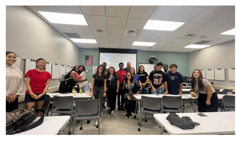
Broward Collage International Students.

Whilesome may underestimate the value of a community college education, the numbers dont lie. A significant percentage of students graduate from community colleges and move on to achieve great success in their chosen fields. The support