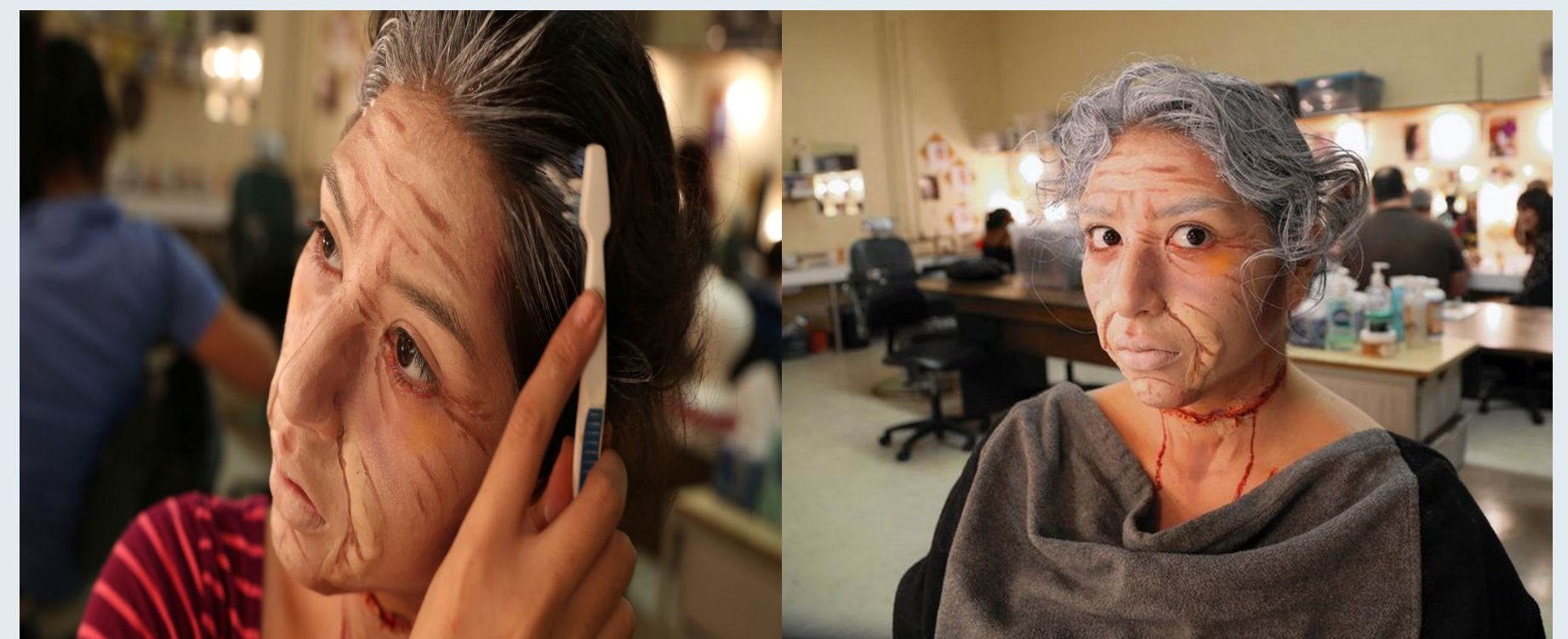
Aging Stage Makeup