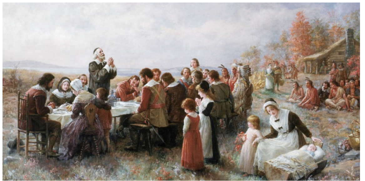
The First Thanksgiving at Plymouth , oil on canvas, by Jennie Augusta Brownscombe, 1914