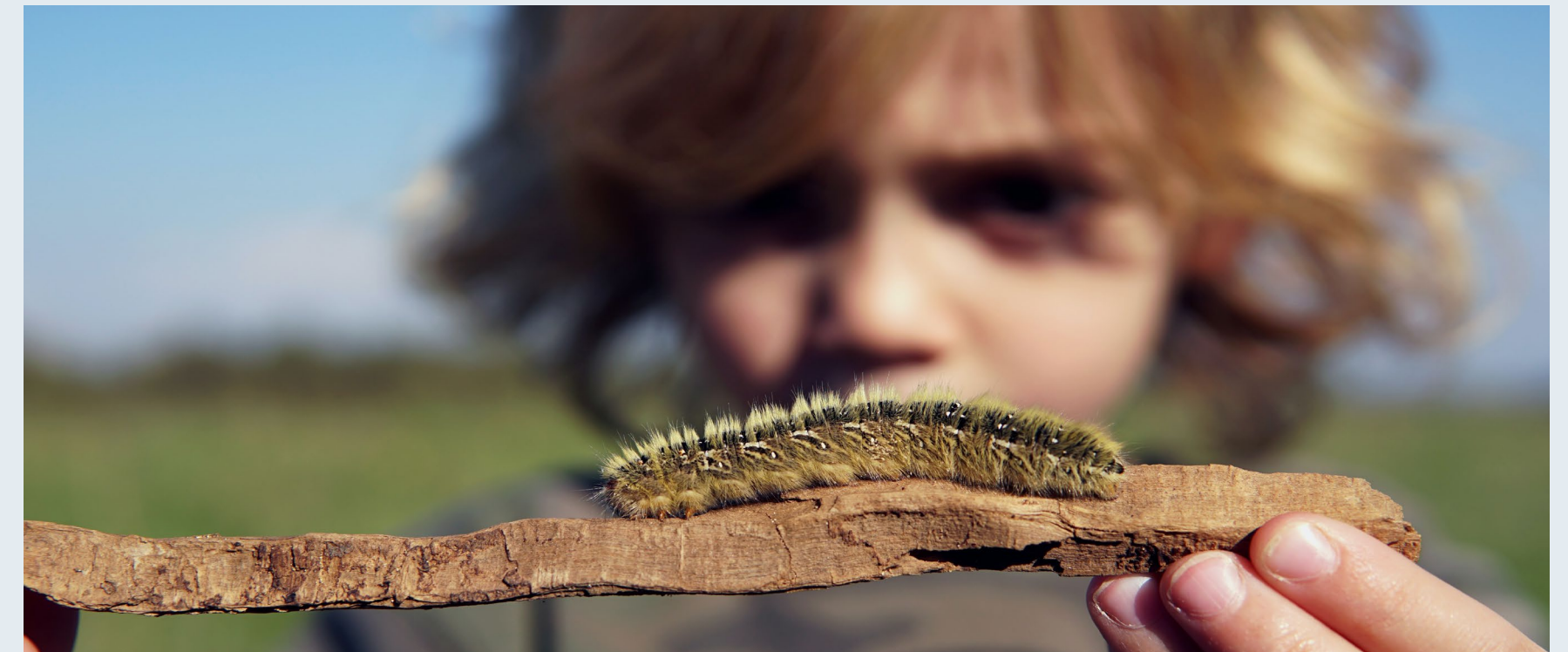
Child Observing Caterpillar