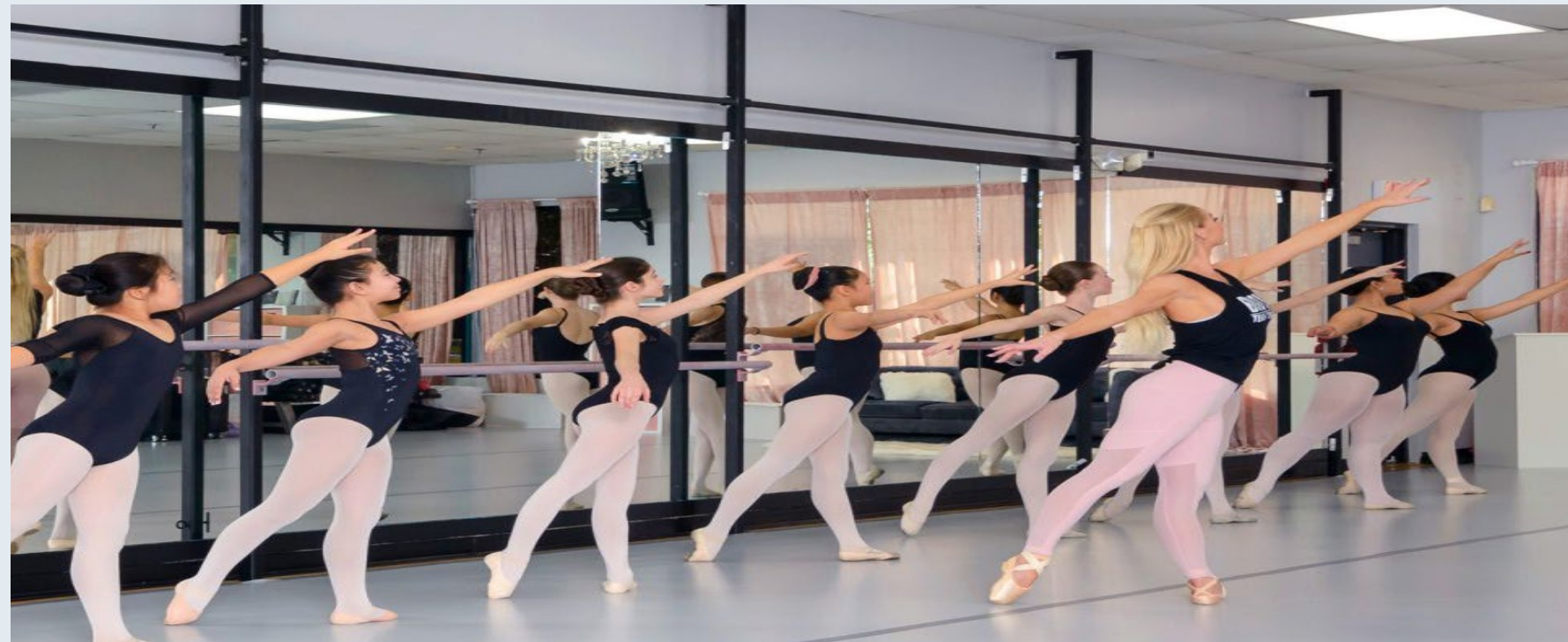
Ballet School at Speck Fitness