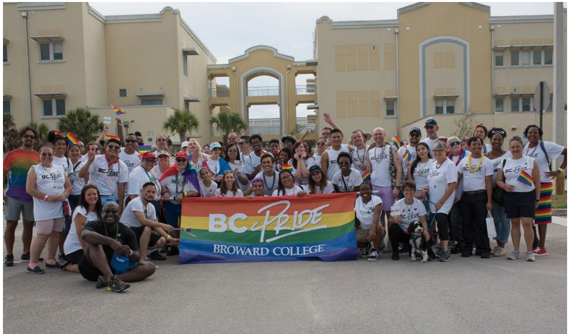
2019 Stonewall Festival with BC Pride.

GSA offers access to many resources such as scholarships to lighten the financial burden, the