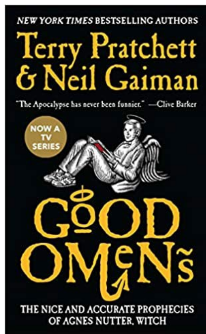
Angel and Demon Covers of 'Good Omens'

Another element I appreciated in Good Omens is how the authors explored the philosophical nature of good and evil, how the world is gray and not black and white. "It may help to understand human affairs to be clear that most of the great triumphs and tragedies of history are caused, not by people being fundamentally good or fundamentally bad, but by people being fundamentally people." I think this quote should be reflected and it truly shows the realness of how our world has caused both pain and harmony.