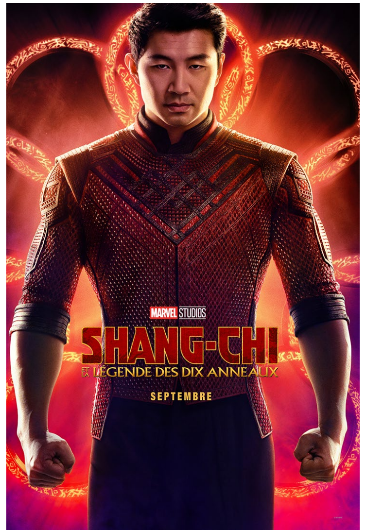
'Shang-Chi', starring Simu Liu

Another expected premiere will also be released on Sept. 17. The Eyes of Tammy Fay , a biographical drama, was directed by Michael Showalter and is based on the 2000 full-length documentary of the same name about the life of Tammy Fay, an American Christian singer, evangelist, entrepreneur, author and TV show host. The film tells the story of the rise, fall and remorse of TV evangelists Tammy Fay Bakker and her husband Jimmy Bakker. They built around themselves a powerful empire for making money, which collapsed