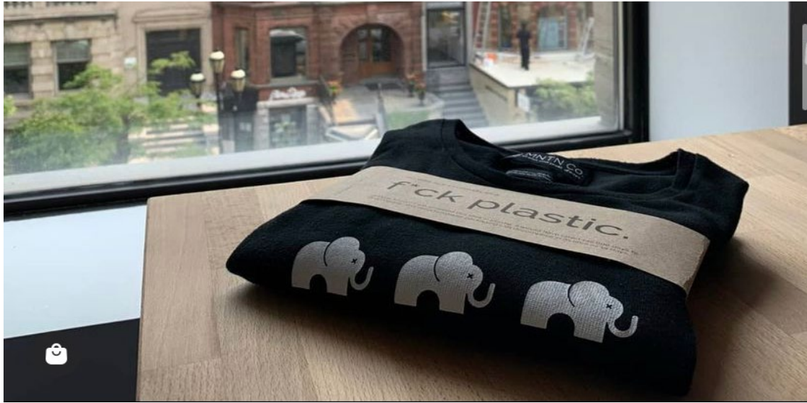
MNTN Co. uses completely sustainable materials, down to the banderol their products are packaged in.

Since the company’s inception in 2018 they have worked on developing a business plan that focuses on the concept of “planet over profit with the environment, animals, and the death of corporate greed at the forefront,” according to the company’s website. They achieve this by sourcing their raw materials from fully transparent organic cotton growers,