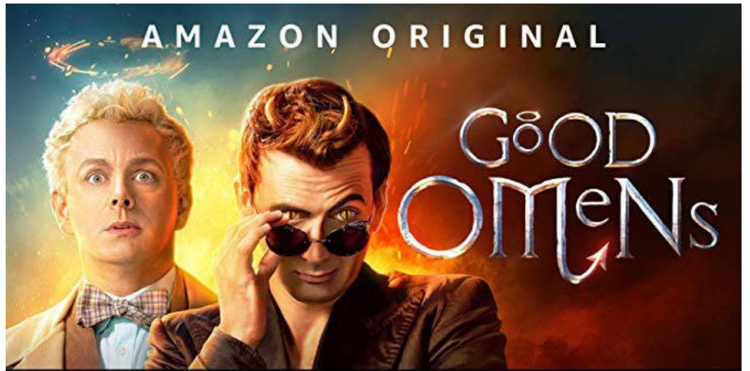
'Good Omens', starring Michael Sheen and David Tennant

Good Omens is a very philosophical piece of media. It focuses on traditional concepts of good and evil and treats their interplay as an affair that creates what might be called 'true good'; a balance between the two. Heaven or hell utterly prevailing would be disastrous for humanity,