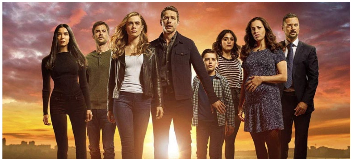
The Cast of 'Manifest'

Manifest was originally added to Netflix in June. Now available for streaming are the first three seasons of the show, which is at the Top 3 Spot in the U.S. at the time of this article being written. Following along with the trajectory of previous NBC hits, we may see a season 4 premiere date by April